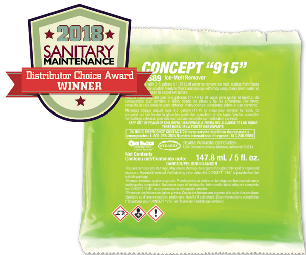
Concept "915" #2308589, 5 fl. oz. pack

Concept "915" removes salt stains from carpets and floors. Powerful chelating agents chemically suspend the salt and chloride residues in the mop solution or carpet extractor so that they do not redeposit in an unsightly white crust for a sparkling clean.