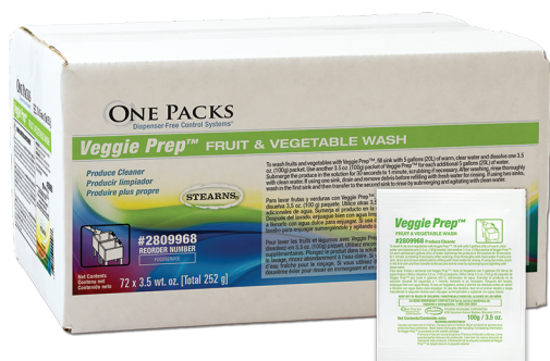
Veggie Prep™ Fruit & Vegetable Wash #2509968

Some lessons are timeless, like learning from an early age to always rinse your fruits and veggies before eating them. But did you know that washing your fruits and vegetables with cold water only removes up to 80% of contaminants and pesticides.